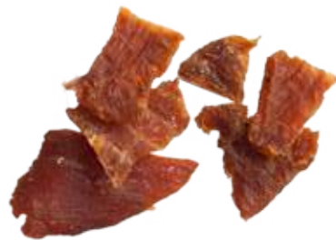
HICKORY SMOKED TURKEY JERKY

Our passionate team of foodies uses consumer data and culinary expertise to constantly create unique and satisfying flavors. With products dropping every month, there's always something new to try!