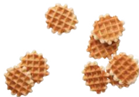
MINI BELGIAN WAFFLES