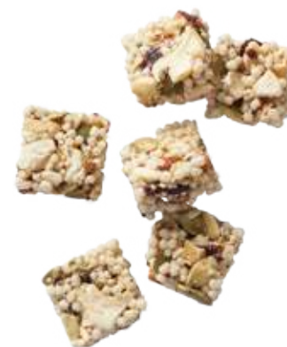
BLUEBERRY ALMOND QUINOA BITES